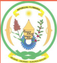
Rwanda Ministry of Health