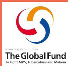
The Global Fund to Fight AIDS, Tuberculosis & Malaria