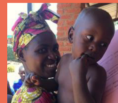
Nurses & Mothers